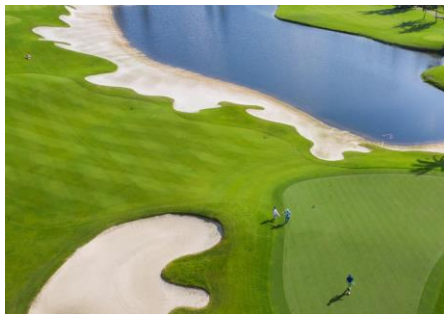
BFA Golf Club