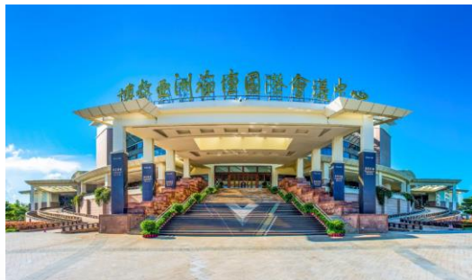
BFA International Conference Center