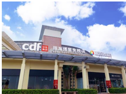
Boao Duty-Free Shop