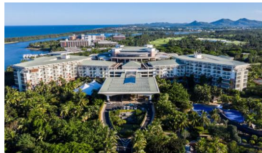
Boao Forum for Asia Hotel