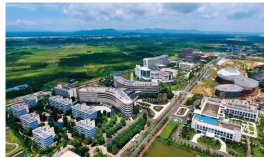
Boao Lecheng Pilot Zone of International Medical Tourism